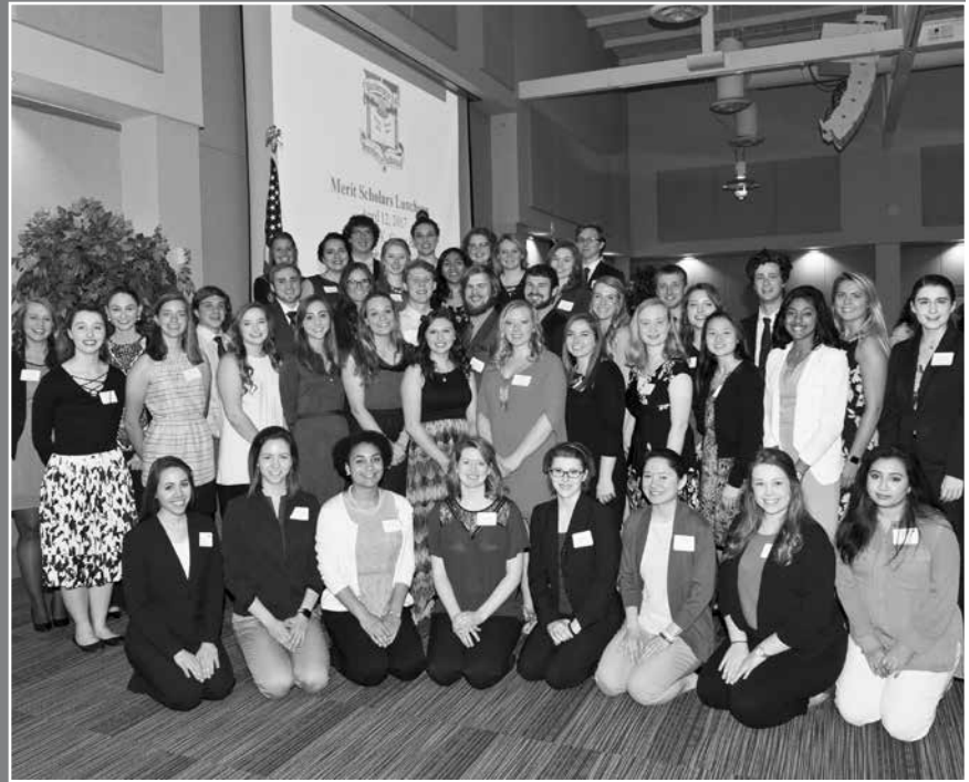
2016-2017 USI Merit Scholars recognize the generous donors of the University.