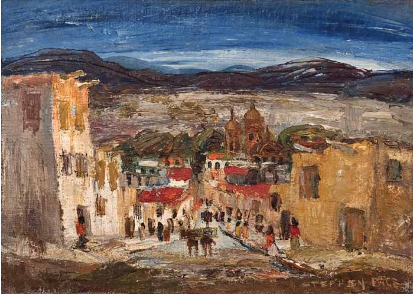
San Miguel, 46-1