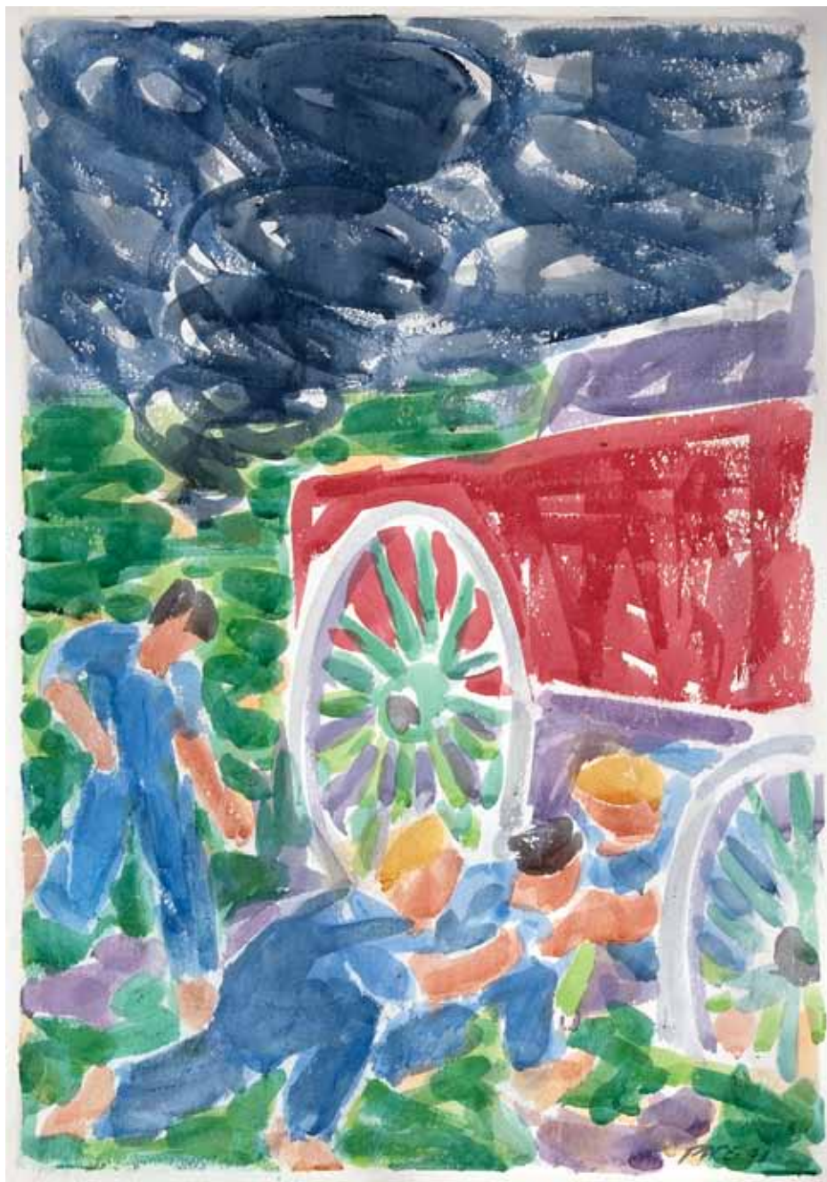
Seeking Shelter #2 , 91-W17