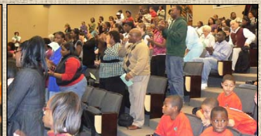
Above, over 300 people attended the 2008 Gospel Explosion. This event was concluded by having both choirs singing a song together and the entire audience singing "Amazing Grace."