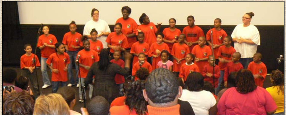
Designed by Grace held a youth workshop for the second consecutive year. The youth performed during the 2008 Gospel Explosion.

For more information on joining the choir or performance dates, contact the Multicultural center at 465-7188 .