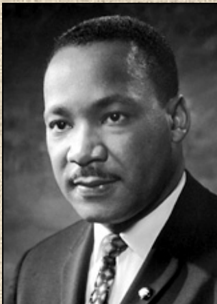
Dr. Martin Luther King, Jr.

He delivered his "I Have a Dream" speech on August 28, 1963 at the Lincoln Memorial in Washington, D.C.