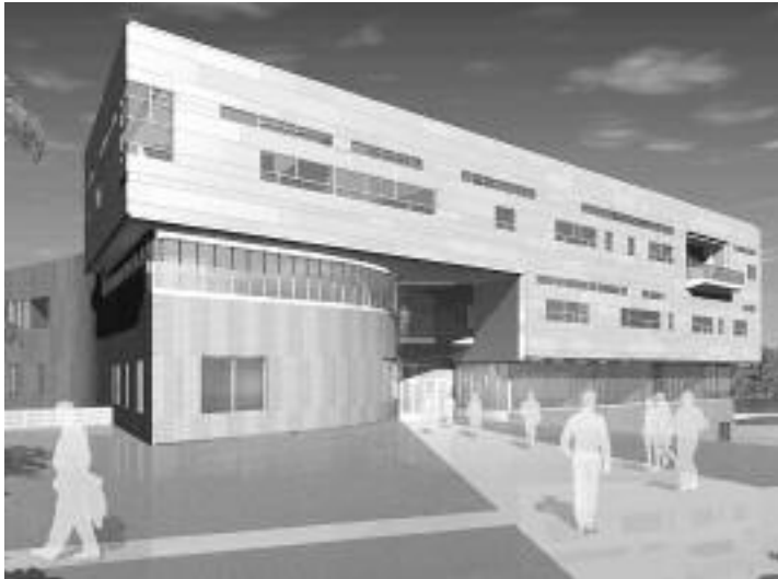
Business and Engineering Center

A new $29.9 million Business and Engineering Center will be the home for the engineering program, providing space for growth of the program as well as