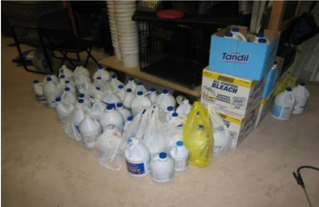
An image of the bleach CSC donated to the Warrick County Humane Society.