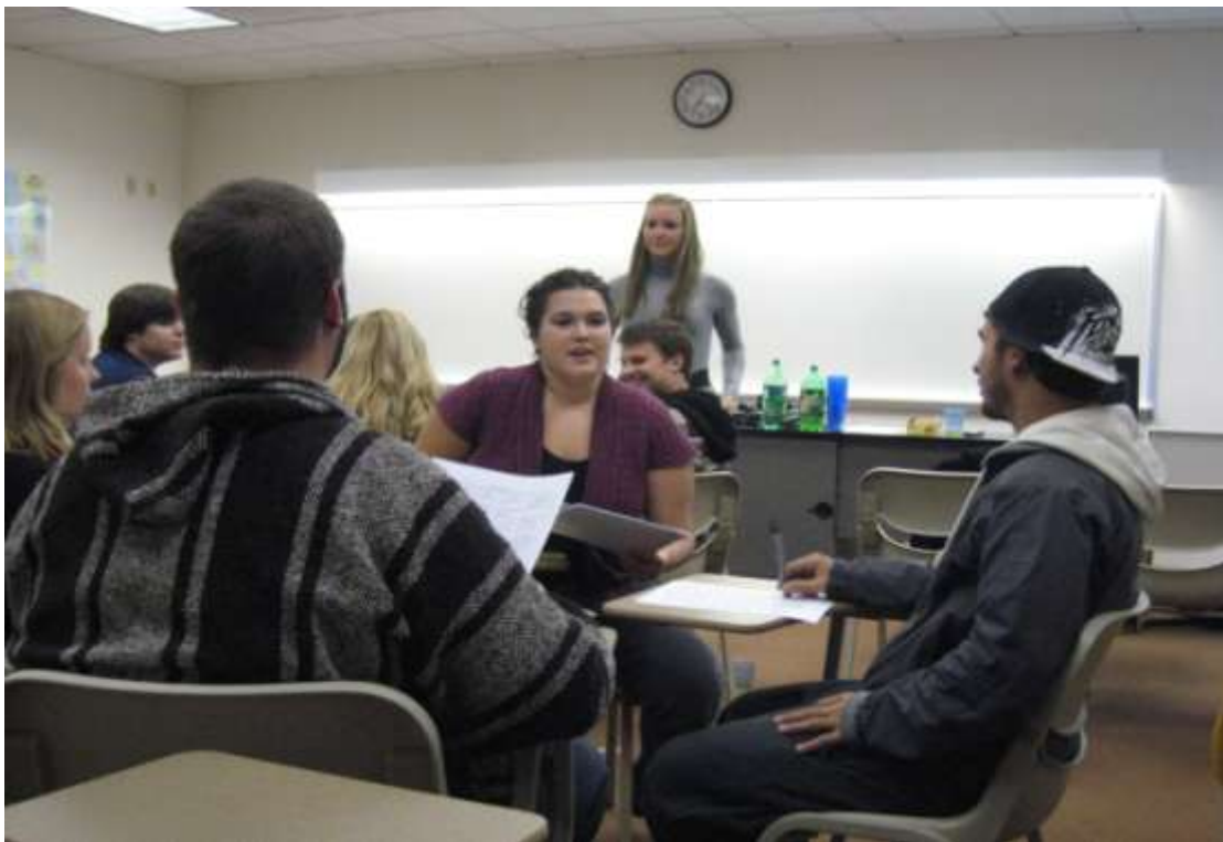
Students participating in the managing life workshop.