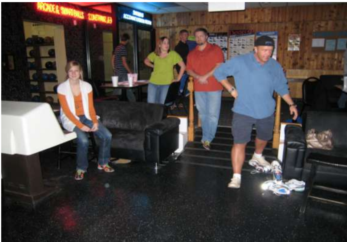
CSC members at the annual bowling with the Communication Studies Professors event.