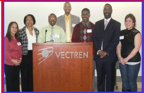
Vectren Corporation Executive Diversity Scholars Vectren Corp. Team Members

counter supervisors, colleagues, and subordinates in their future careers. Those who attended were eager to express their appreciation to the presenters for sharing the knowledge and an interest in continuing the partnership.