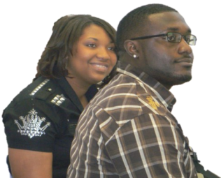
USI Black Alumni Society 2011 Homecoming Reception

Due to the number of students who have expressed a need for the MCC to be open later, the entire Multicultural Center Staff, is excited to announce that the MCC has extended its hours of operation. Our new hours are Monday—Thursday, 8am until 6pm. The majority of the office's business will continue to take place before 4:30pm; however, the Center will be open later to be that hub for intellectual discussion, socializing, and checking Facebook between classes until 6pm that has earned us the reputation for being a "home away from home." If you haven't been to the MCC yet, then you are missing out. Friend us on Facebook, take a look at our website, and come by and see us during our new extended hours.