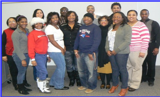
USI Black Alumni Society

2011 Homecoming Reception PAC 209 Sponsored by the USI Alumni and Multicultural Center