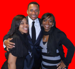
MLK Memorial Luncheon