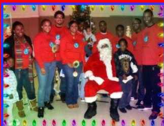
USI's Black Student Union and Santa Claus