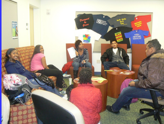
The MCC has moved to UC East, Room 1244

On March 3, the MCC along with the entire expanded UC East, will host a Grand Opening to raise awareness of relocated offices. Visit us between 2:30pm and 4:30pm and see our new space. As the picture to the right suggests, we have an inviting student lounge where both intellectual and humorous dialogue takes place. In addition to seeing our new space, you can learn about some of our programs. Representatives from MCC clubs and organizations will be available to share information for those interested in getting involved; including members from the Black Student Union, Latinos Unidos (Hispanic Student Union), South Asian Student Union, Designed by Grace Gospel Choir, Executive Diversity Scholars, and College Mentors for Kids. The USI Black Alumni Society will also be available with information. Come and see what the "New MCC" is all about.