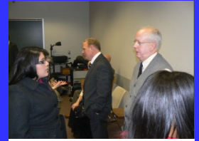
Evansville Bar Association