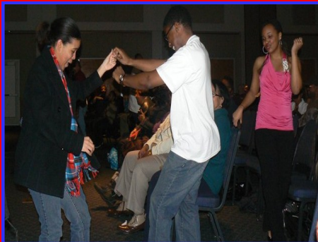
BSU Week—IU Soul Revue