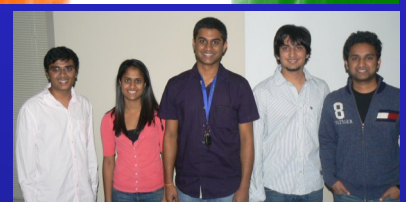
2011 South Asian Union