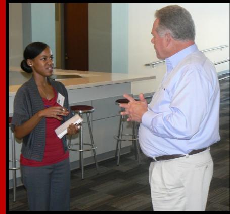
ONB Networking Reception

Scholars were able to connect with individuals who had networks the ONB representatives were willing to share. When this opportunity presented itself, the Diversity Scholars asked that new contact for their business card, and a new network was born. The Executive Diversity Scholars met at 2pm.