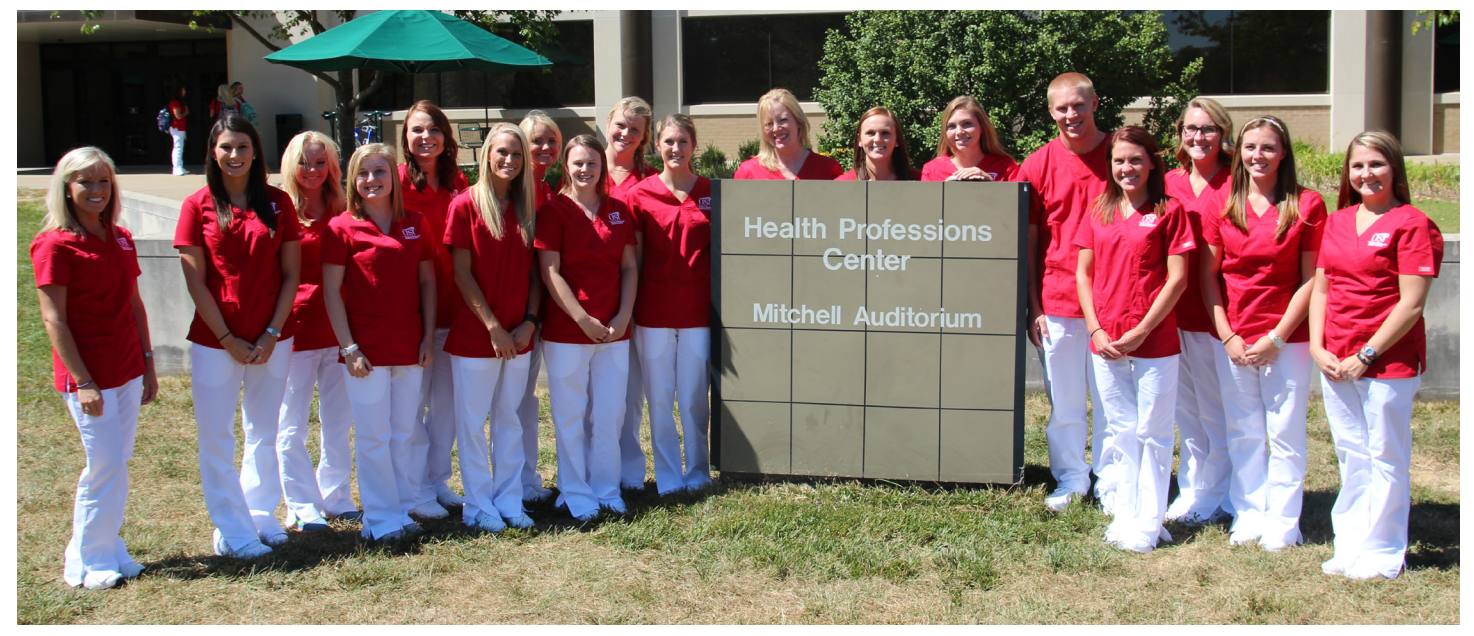
Members of the first cohort in USI's accelerated undergradute nursing program plan to graduate in December 2016.

"Basically, on August 1, we choose 130 nursing students who meet the criteria for our program," said Swenty. "Students are chosen for the traditional or accelerated programs based on the best match for the student and the Nursing Program."