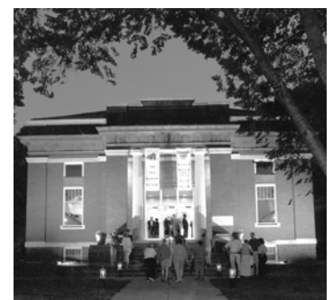
Murphy Auditorium was built in 1914. It is part of the New Harmony National Landmark District, one of only 50 districts so designated by the National Park Service.

the University of Southern Indiana, the renovations became a priority for him shortly after he came to USI in 2005. He said, "The New Harmony Theatre is a wonderful program. My family and I enjoy the productions each summer, but the old seats were uncomfortable. I think the new seats and the other renovations will enhance the theatre experience."