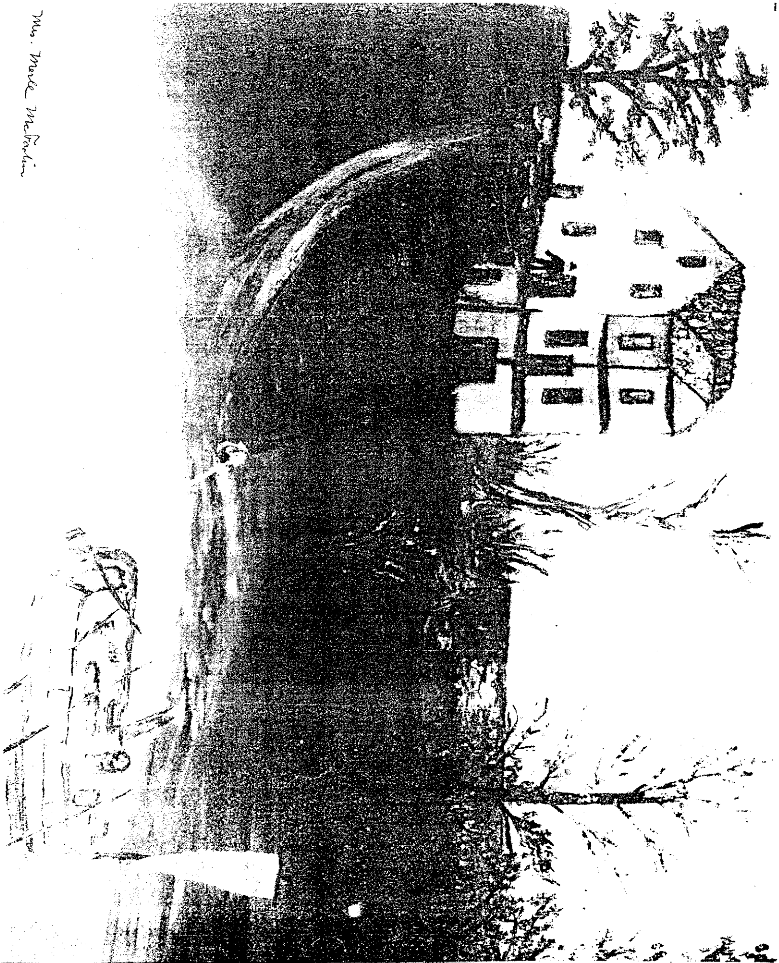
MOUNT VERNON - McFADDIN'S BLUFF BLUFF by Mrs. Meckle McFadin 1826 (PRESENT SITE OF WATER WORKS)