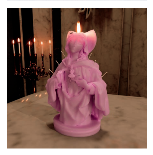
Clothing brand: @kitowares

"sacred space" where he doesn't have to be serious and professional. He carries a camera with him wherever he goes to capture the moments he lives. Even if some of the photos come out awful, he doesn't stress because he had fun taking them, and that is what matters.