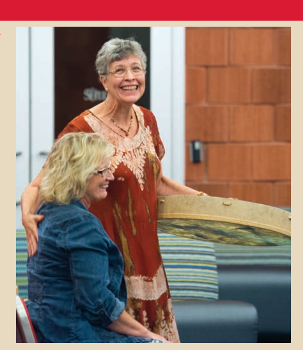
Mid-America Institute on Aging drumming session