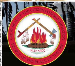
The Citizen Potawatomi Nation