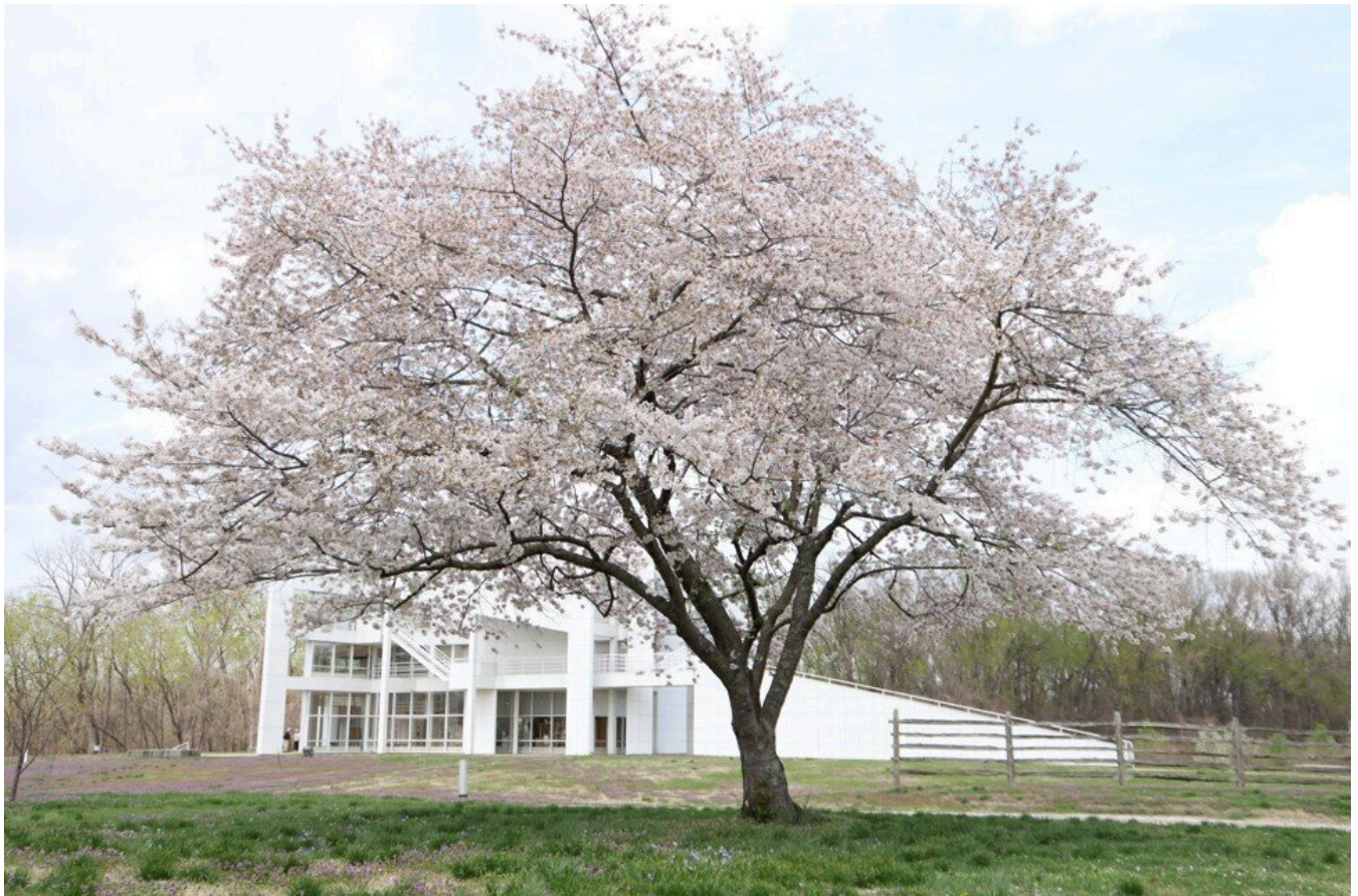
Cherry blossom tree in bloom near the Atheneum Visitors Center, March 2025.