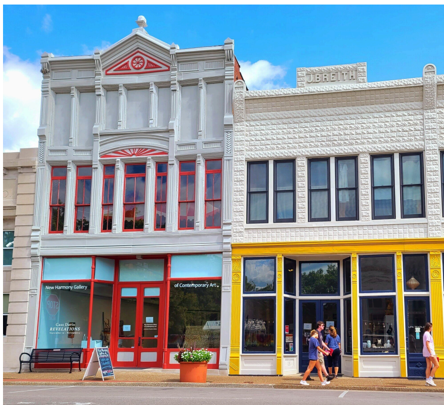
New Harmony Gallery of Contemporary Art, 506 Main Street.