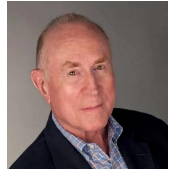
Pulitzer Prize-winning author Richard Rhodes