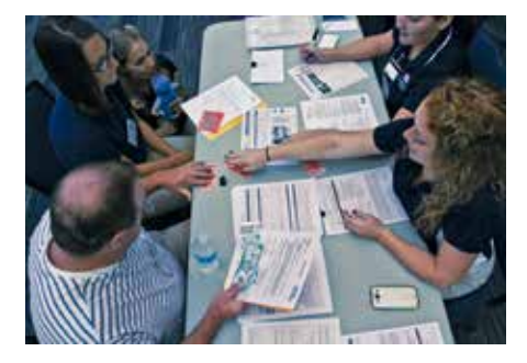
Poverty simulation participants role playing

To help students empathize with their clients, they each took on the persona of a person in poverty or a community employer dealing with employees' dire straits. Booths were set up representing everything from service agencies to pawn shops. A 30-day calendar cycle was broken into four 15-minute segments, each one representing a week. Participants were then assigned a different family structure–such as single father raising three children or a single elderly woman living