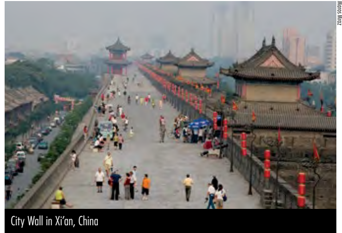
City Wall in Xi'an, China