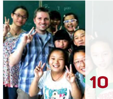
Social media enhances experiences