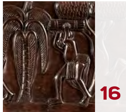
African artifacts expand knowledge