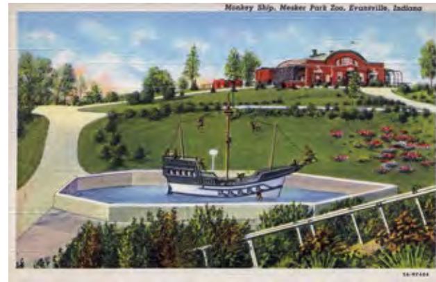
Colorone Loge News linen postcard circa 1933

"I noticed something odd; the butterflies moved their tails out of sync with the rest of their bodies, with long hairs on their hindwings moving much like the antennal movement of beetles and wasps."