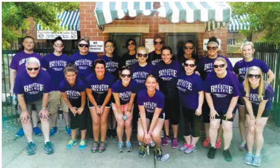
Great Strides Walk for Cystic Fibrosis team gathers at Bosse Field.

“Cystic Fibrosis (CF) is a life-threatening genetic disease that primarily affects the lungs and digestive system,” said Delp.