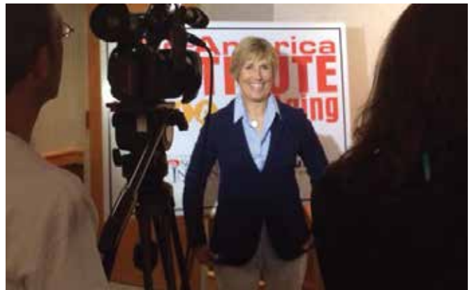
Diana Nyad at MAIA during a press conference.