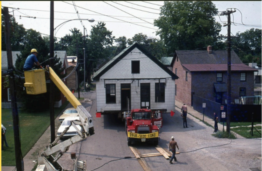
Relocation of the Cooper Shop from Frederick Street to the corner of Church and Brewery Streets on July 10, 1975. This building is now the home of Black Lodge Coffee Roasters.

Every memory matters. Every story builds our shared identity. Let's remember together!