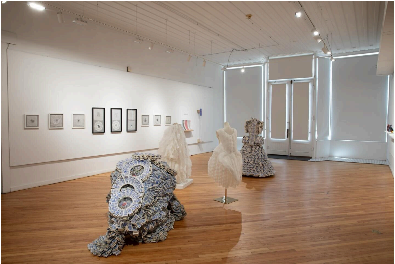
Transcendence at the New Harmony Gallery of Contemporary Art, 506 Main Street.