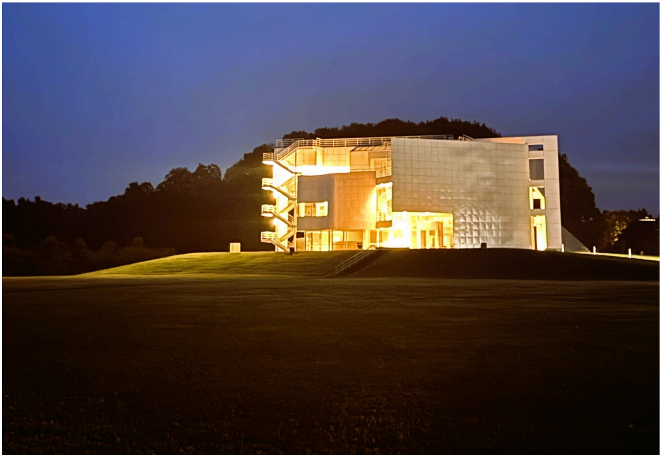
Atheneum Visitors Center at Dusk, June 1, 2025.