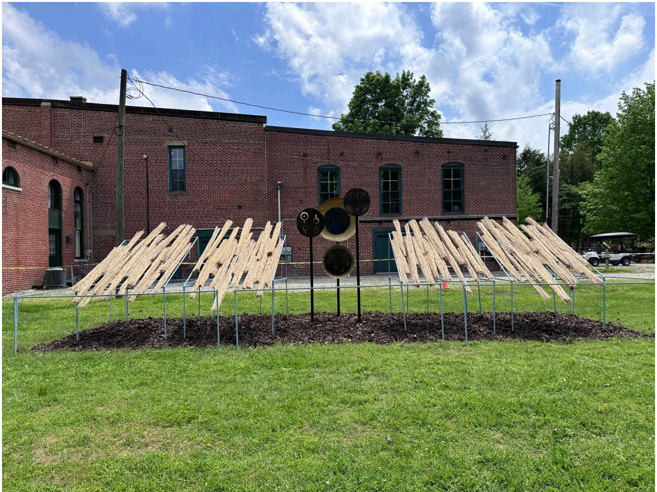
Christopher Blay, Signals and Satellites to the Ancestars (2025).