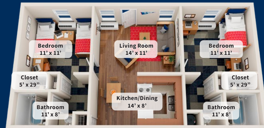
One-bedroom apartment (floor plan not pictured)

living room - 14' x 11' bedroom - 11' x 11' bedroom closet - 5' x 29" bathroom - 11' x 8' kitchen - 14' x 8'