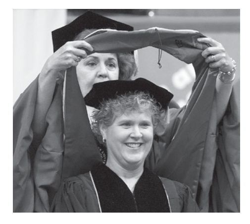
The first class to graduate from the DNP program received degrees in May 2011.

The first DNP class to graduate, in May 2011, are recognized as graduates of a CCNE-accredited DNP program.