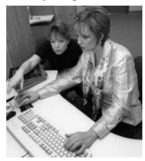
The Day Learning Resource Center provides access to the latest teaching and learning technology.