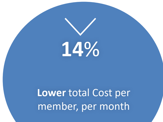
Estimated University Savings